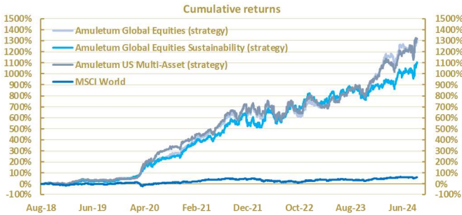
Cumulative returns with transaction costs *